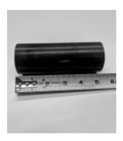
4. Cut the ABS or PVC 1 ½" pipe 3 inches shorter than the distance between the floor/slab and the P-trap.