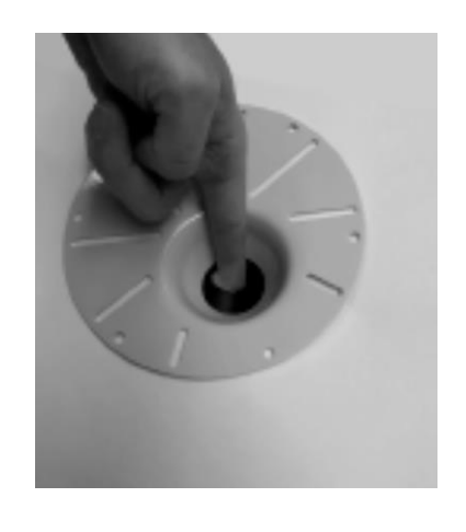
12. Apply provided lubricant inside the Drain kit. Please only proceed with this step once the pressure test has been performed, if needed.