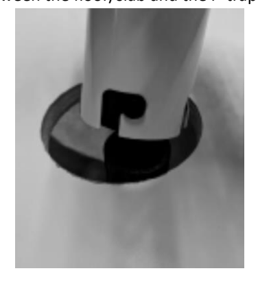
7. Slide the Drain Kit on the ABS or PVC 1 ½" pipe making sure it sits flat on the floor. *