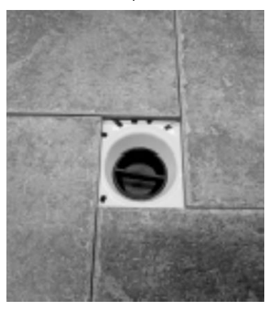
Install your flooring surface around the opening of the Drain Kit.