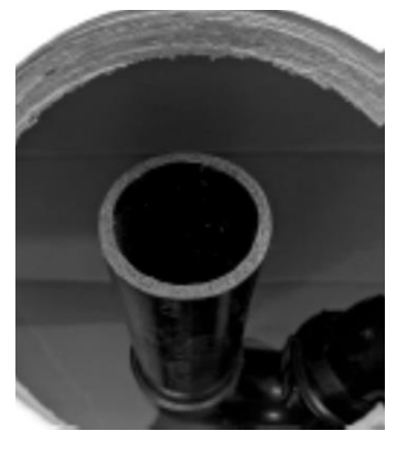
5. Apply glue to the outside of the ABS or PVC 1 ½" pipe and to the inside of the Ptrap. Insert the pipe into the P-trap.