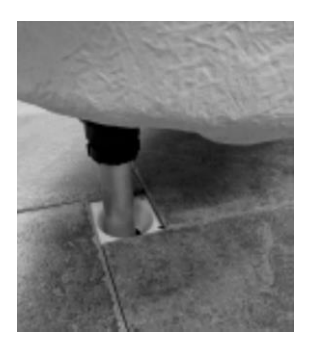
15. With caution, slowly insert the bathtub tailpiece into the Drain Kit.

16. Leave the bathtub in this position for at least 24 hours before use.